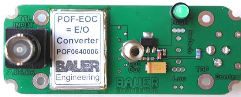
Fig. 1 E/O converter single power level, OEM module

DATASHEET - Version 1.2, Date: 12.04.2007