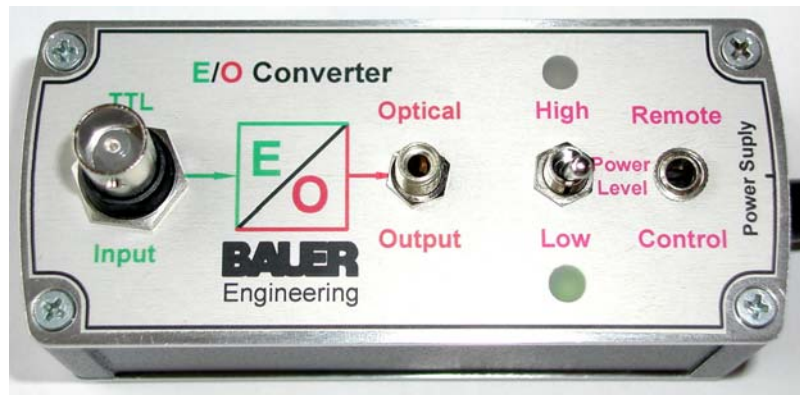
Fig. 2: E/O Converter single power level, device