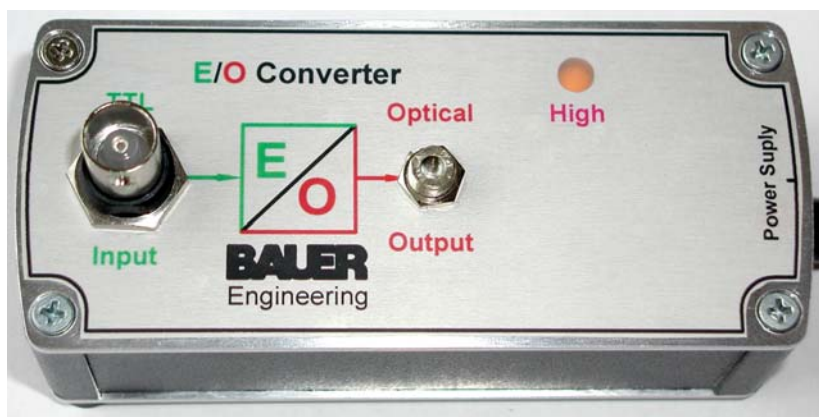
Fig. 3: E/O Converter dual power level, device